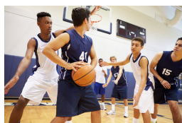
Boys High School Basketball