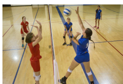
Boys/Girls 7/8th Volleyball