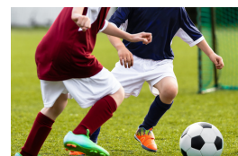
Boys/Girls High School Soccer