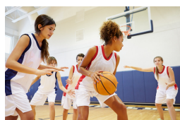
Boys/Girls 7/8th Basketball