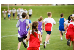
Boys/Girls 7/8th Cross Country