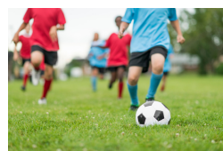
Boys/Girls 7/8th Soccer